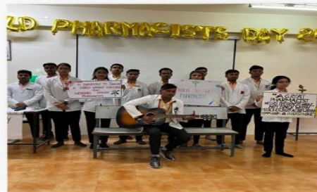
World Pharmacist's Day