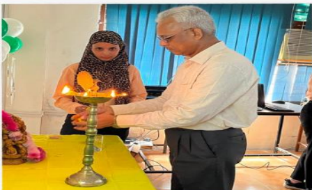
World Pharmacist's Day